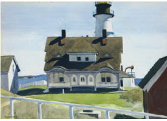
Edward Hopper, Captain Strout's House, Portland Head 1927 Wadsworth Atheneum Museum of Art, on loan to Portland Museum of Art